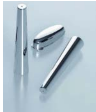
High performance coating of cosmetics packaging