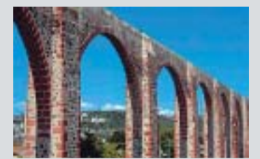
Landmark of Querétaro in Mexico