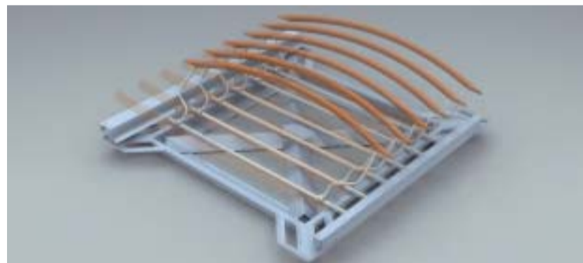
Top left: Spray station Top right: Flaming station Below: Flip-flop pallet

ally, a flaming station was installed for pretreatment, to cost effectively apply single layer paints without reduction in coating quality.