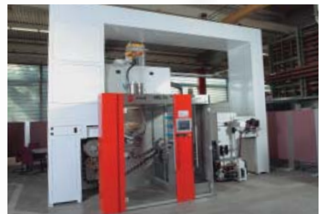
For continuous process testings and customer demonstrations of the HIL-70, a transfer system with all transfer stations has been installed on the internal coating machine