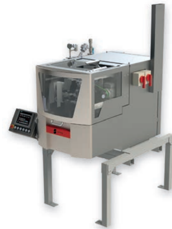
Modular system: „stand-alone“ or „table-top“ version