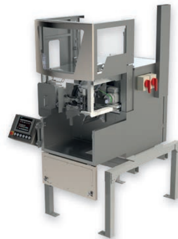
Optimized accessibility due to automatable cover panel lift